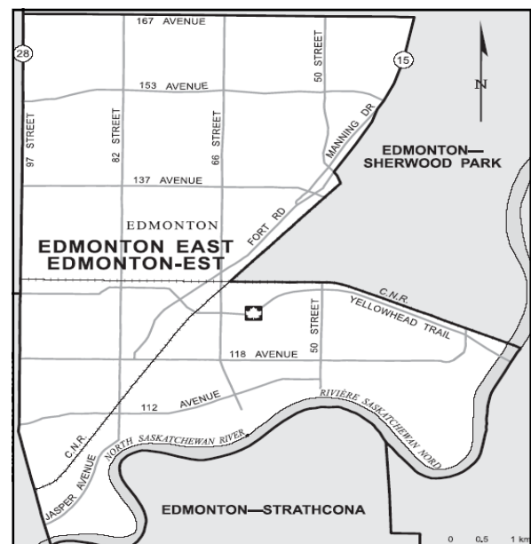
The Boundaries of Edmonton East